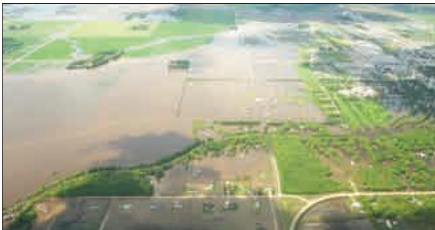
Flood waters submerged most of Roseau, Minn. in 2002

Moreover, the National Weather Service could only rely on rainfall totals from four locations: Roseau (4.42 inches), Hallock (1.31 inches), Thief River Falls (3.34 inches) and Saum (2.34 inches). With the help of volunteer precipitation observers, the Climatology Office helped gather about 20 additional rainfall totals from the area, putting the average rainfall at 4.6 inches. Now, the weather service could make a confident prediction.