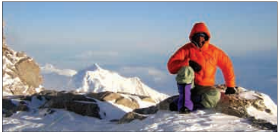
Clear skies at 17,200 feet